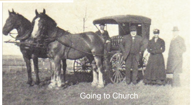
Going to Church