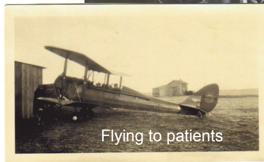
Flying to patients