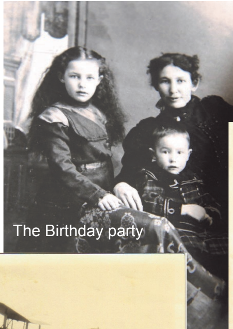
The Birthday party